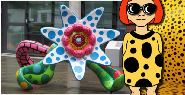
Yayoi Kusama - Flowers That Bloom Tomorrow, Square Mile, London, 2012

SHE LIKES TO MAKE SCULPTURES TOO! OF COURSE, THEY ARE COVERED IN DOTS!