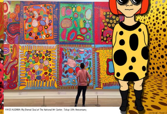
YAYOI KUSAMA: My Eternal Soul at The National Art Center, Tokyo 10th Anniversary

WHAT DO YOU THINK IT WOULD FEEL LIKE TO BE THE PERSON STANDING IN FRONT OF THIS ARTWORK BY KUSAMA?