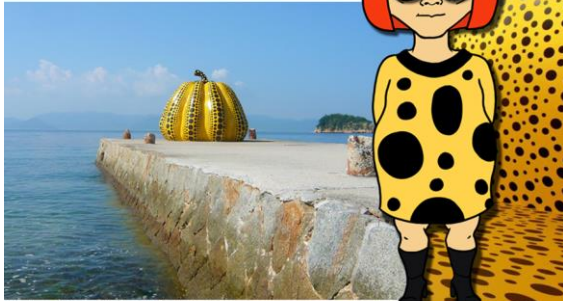
Yayoi Kusama - Pumpkin, 1996, Benesse Art Site, Naoshima, Japan

YOU CAN WALK AROUND THIS PUMPKIN BY KUSAMA. THIS PUMPKIN IS A SCULPTURE!