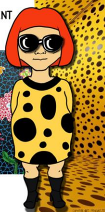
Flowers by Yayoi Kusama

WHY DO YOU THINK SHE LIKES DOTS SO MUCH?